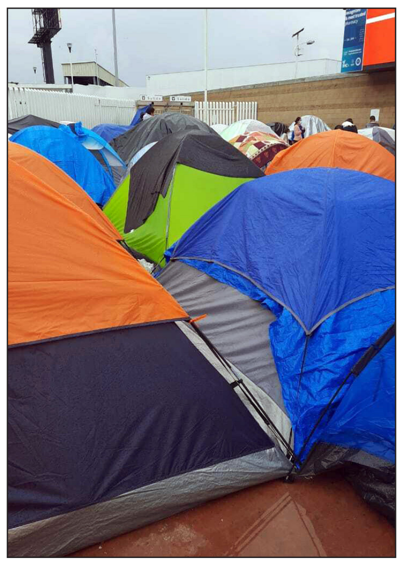
Haitian migrant tents in Tijuana

The authors offer nine recommendations, first and foremost, that the Title 42 policy be revoked immediately. Other recommendations include that ICE and CBP follow public health experts' advice by adopting a wide range of safety measures to mitigate public health risks to border agents. Lastly, the authors recommend that asylum processing be resumed while releasing migrants to shelter in place with their loved ones in the United States rather than detaining them.