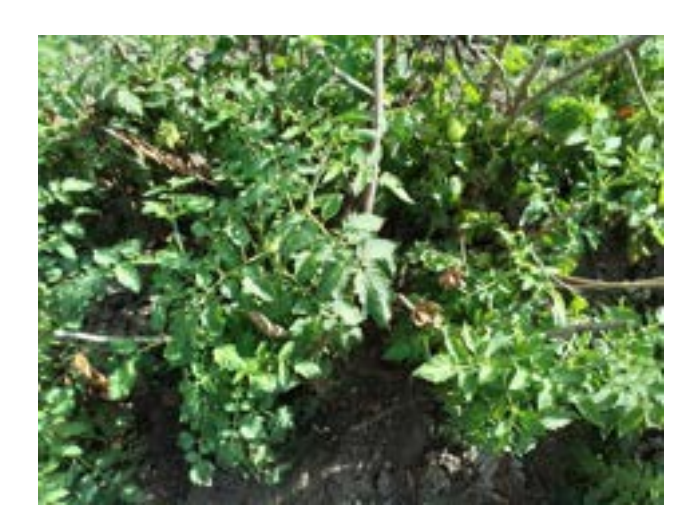
Tomatoes in production