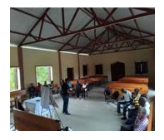
Training on Mutuelle de solidarité