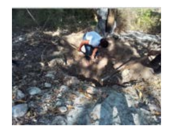
Garbage can hole.

Yard clean-up and protection activities have been carried out at the level of certain families by setting up garbage can holes after sorting the waste. Non-degradable waste is burned, while degradable waste is used to make compost.