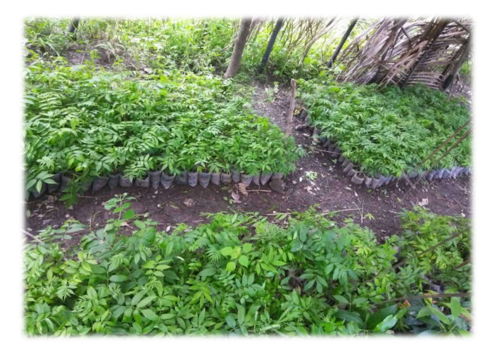
Seedlings at tree nursery in Bigue

In Haiti, we have worked with the Jean Marie Vincent Formation Center since 1999 on a program rooted in reforestation, agro-ecology and food security. The program was initiated by the community leaders in Gros Morne looking to halt erosion on mountains in the area. The lack of trees was leading to silted riverbeds and mudslides blocking the road during the rainy season. Over the last 22 years, we have planted an estimated 2 million trees: 200,000 of those trees are on the slopes of Tet Mon just outside of Gros Morne, the mountain where the program began. During these 22 years, the program has expanded to include tree planting in all eight of the communal sections in the Gros Morne arrondissement (county). The program also oversees workshops and material support to improve food security for small farmers, assisting with everything from drip irrigation to building and using homemade traps to halt the spread of weevils in sweet potato harvests.